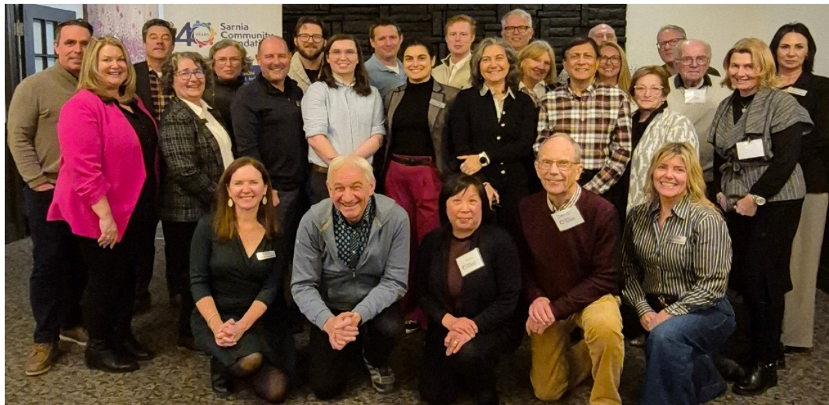
2026 SCF Board of Directors and Committees Meeting – February 24, 2026