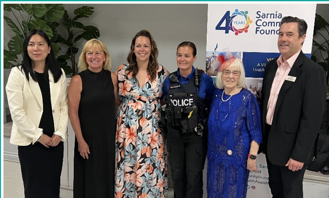
The WOE event will take place on Thursday June 4, 2026 at the event Center at Lambton College.

The nomination form is located online, visit the sarniacommunityfoundation.ca on the home page. All nominations should be received at SCF by Thursday April 2, 2026. Printed nominations will also be accepted at the office 109 Durand Street.